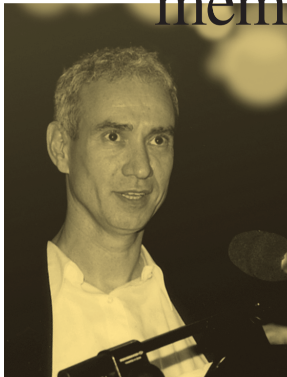
Roland Emmerich Jury President 1999