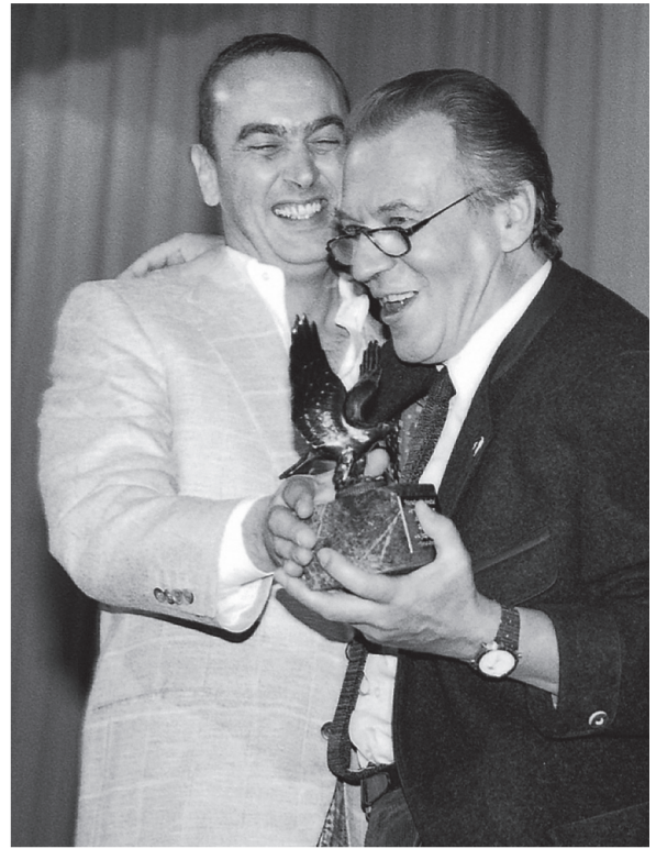
Lars von Trier participant 1981 and 1982